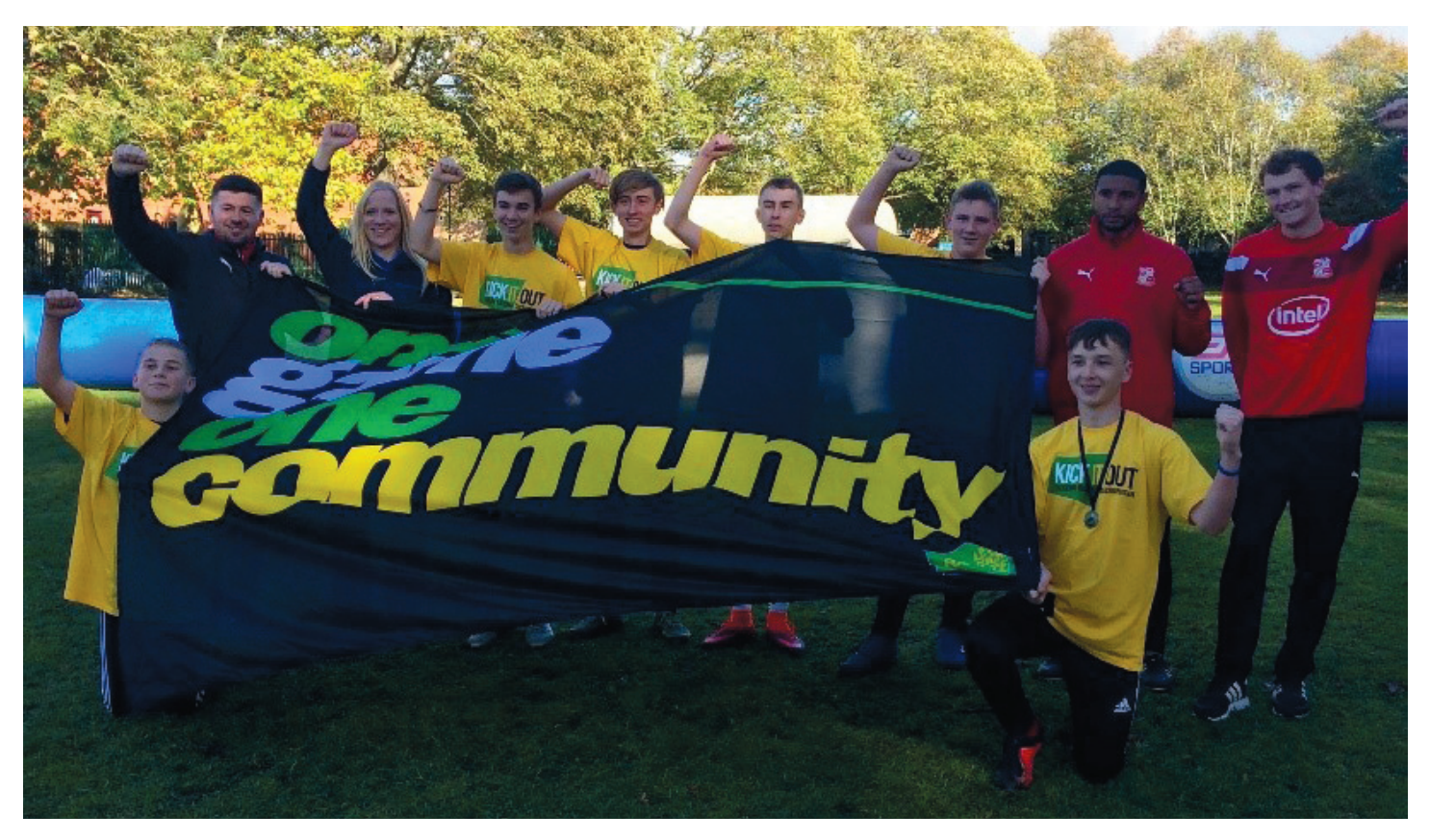
Participants in one of the Kick It Out events in 2018