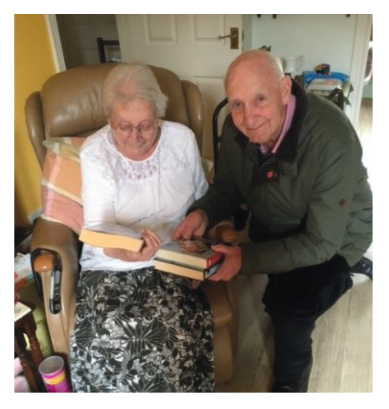
Users of the mobile library service

Providing additional resources for specific occasions, such as Holocaust Memorial Day and LGBT+ History month, such as topic-specific reading lists and